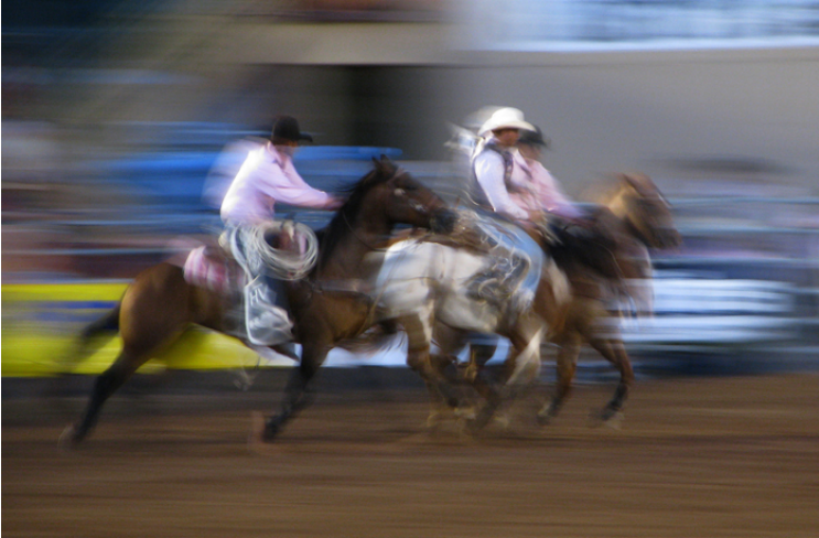
“Zoom, Zoom, Zoom” by Jacqueline Vignone