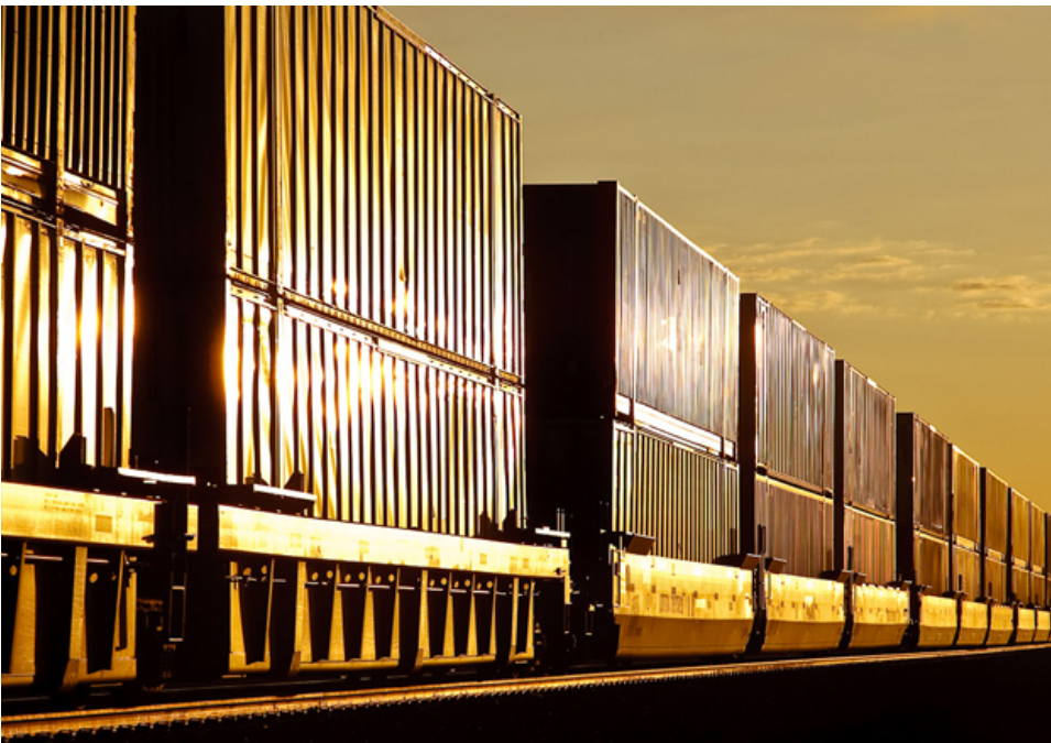
“Golden Freight” by Bruce du Fresne